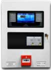
TS1 panel for up to 4 loops