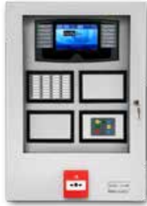
TS2 panel for up to 8 loops