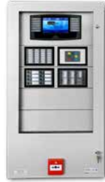
TS3 panel for up to 16 loops